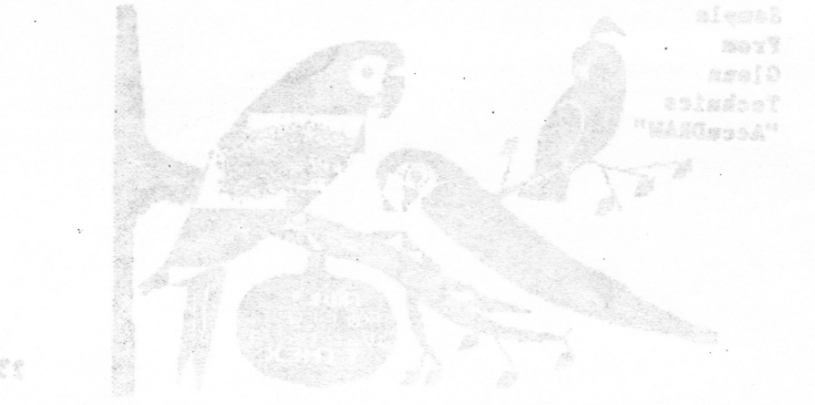
Sample From Glenn Technics "AccurDRAW"